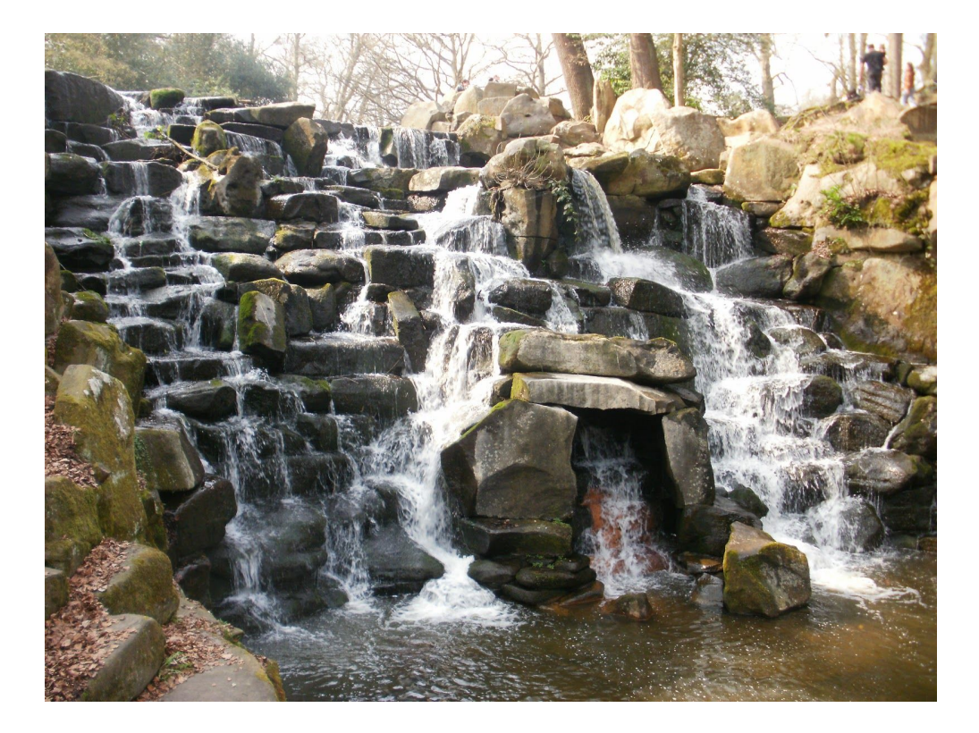
Virginia Water cascades

This article was first published on 26 October 2020 for Greenpeace International